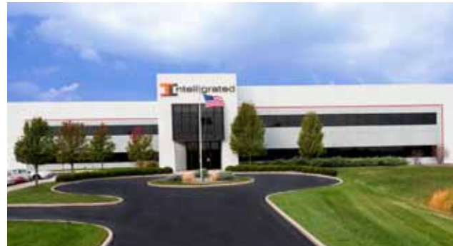
Headquarters in Mason, Ohio

Phone + 1 877.315.3400 www.ontimeparts.com